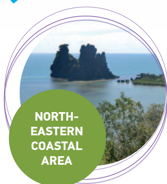
NORTH-EASTERN COASTAL AREA