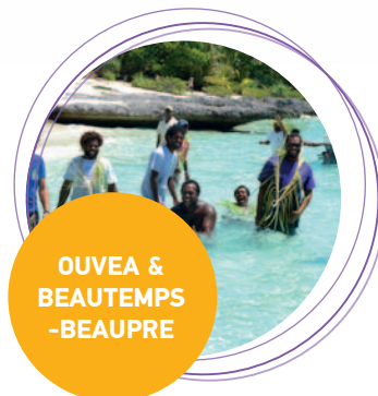
OUEVA & BEAUTEMPS -BEAUPRE

Disposal of long-standing stocks of disused vehicles – support to Popwadene Association for implementing the Poindimie integrated-management plan.