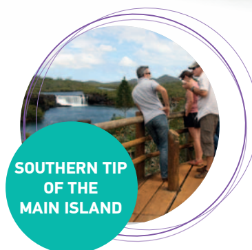
SOUTHERN TIP OF THE MAIN ISLAND

Create a park ranger position; develop a biosecurity plan for Ouvea; coastal erosion monitoring; and environmental-issue awareness.