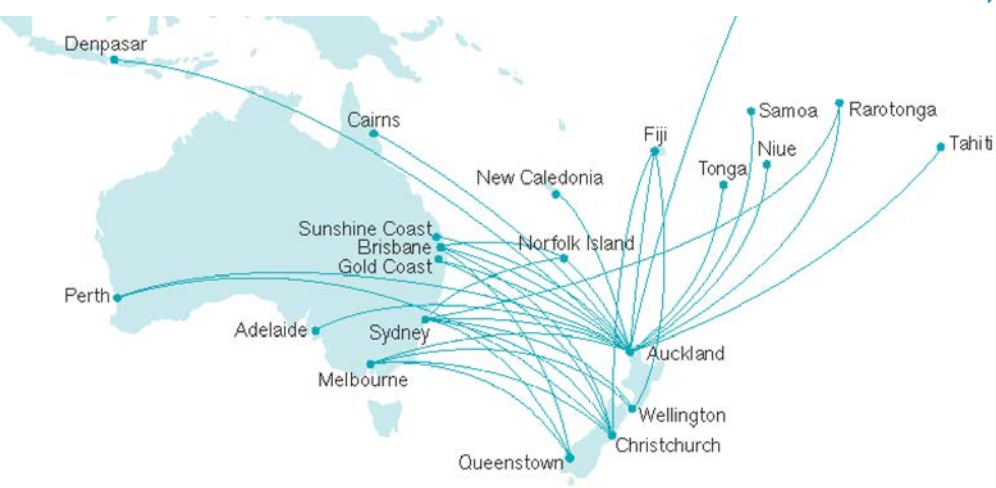
Figure 3: Air New Zealand South Pacific Destinations. 38